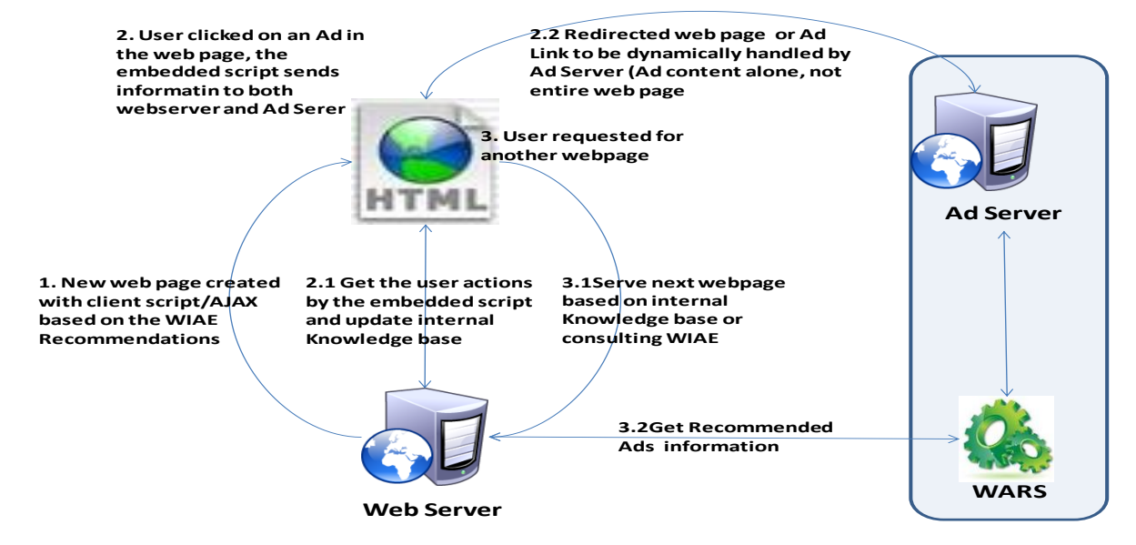
Figure 4: State Diagram of webpage with Ads